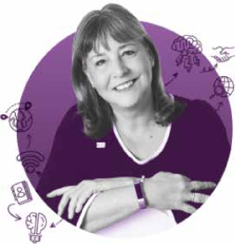
Increase Our Ability to Adapt