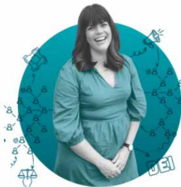
Expand Our Reach